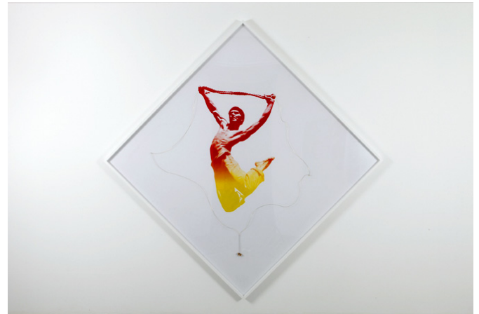
Lothar Hempel Plakat (Spartacus) , 2011 c-print mounted on aluminium, wire, bells, frame 256 x 256 cm