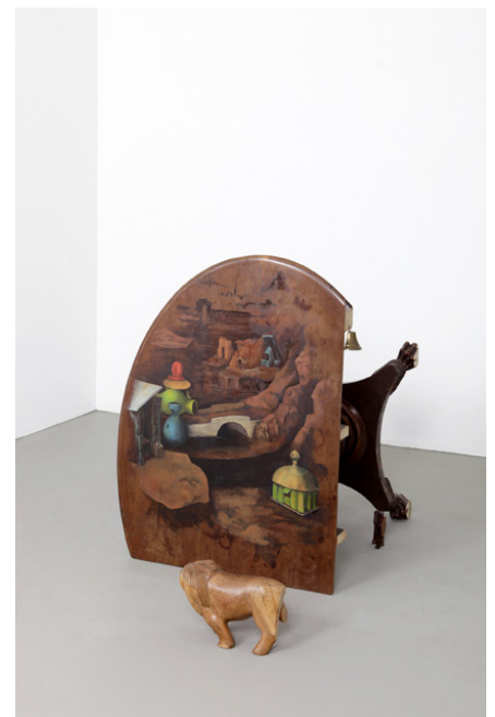
Hadley + Maxwell Away, as in "For Passing Away is the Figure of this World" , 2010 altered furniture & figures, oil paint, bell dimensions variable