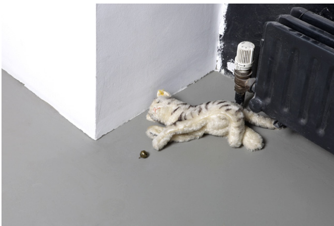
Hadley + Maxwell The Step When I Forget What I Thought My Calling Was , 2011 stuffed toy, bell dimensions variable