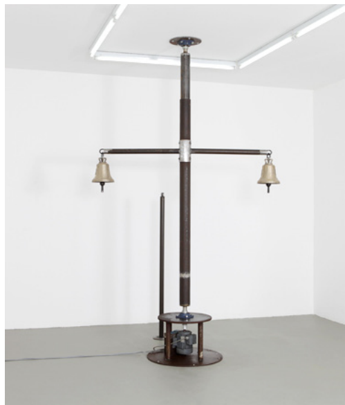
Carsten Höller Vertigo-Glocken (Vertigo-Bells) , 1997 steel, bronze, electric motor dimensions variable (bell diameter 35 cm, height 30 cm)