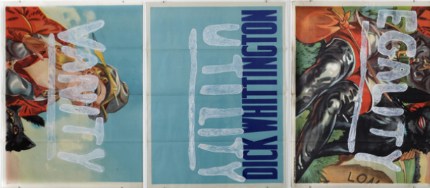
Ruth Ewan Post Anti-Bell Study II (Rosie) , 2011 marker pen on vintage poster three parts, each appr. 101 x 75 cm